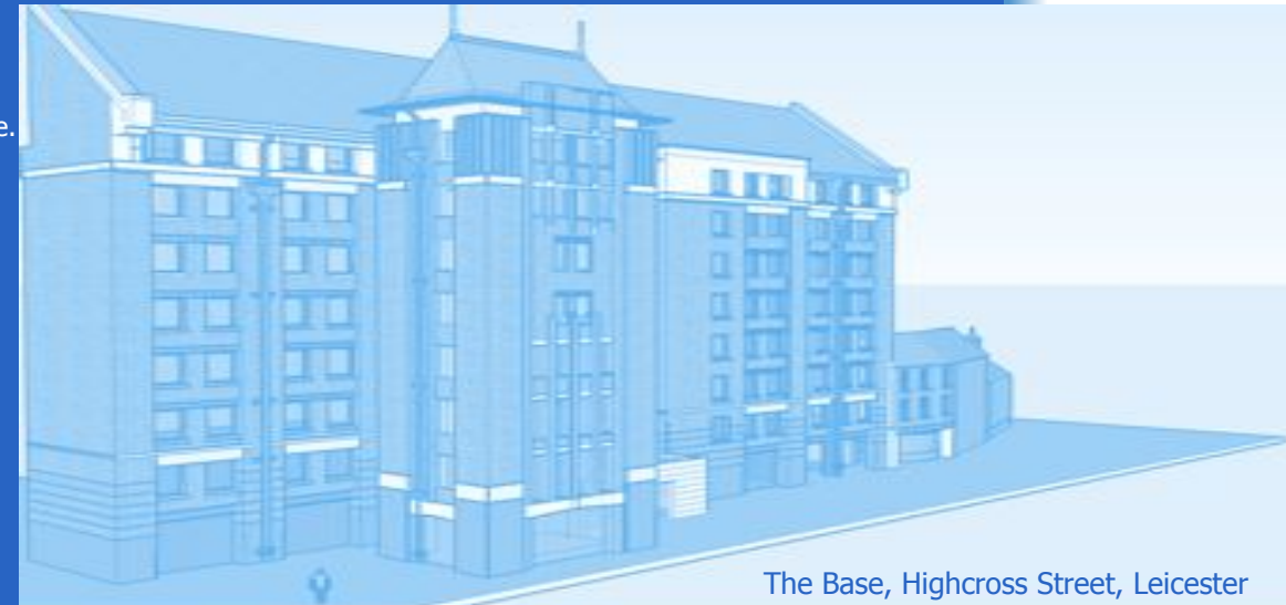
The Base, Highcross Street, Leicester