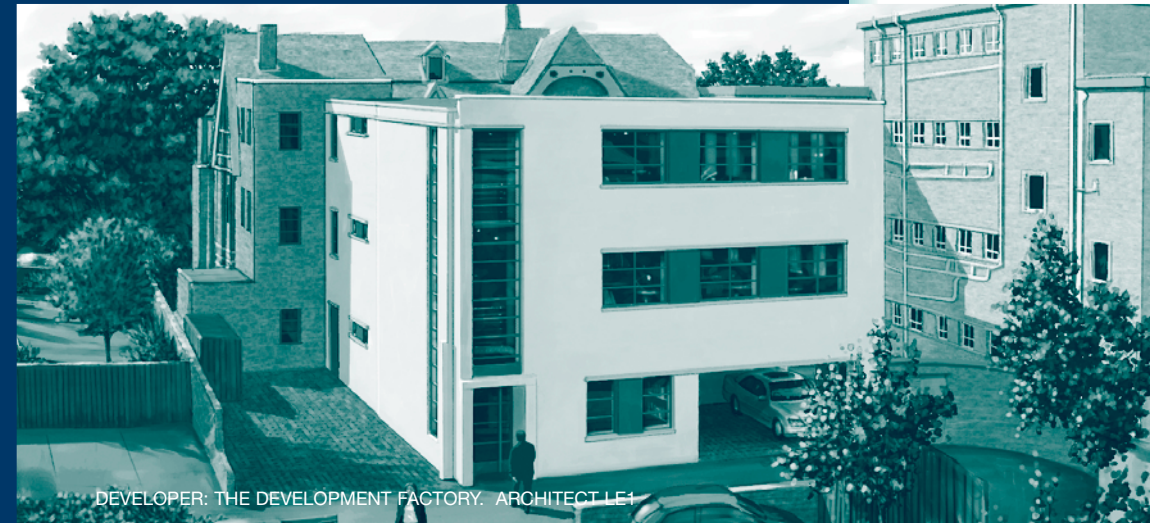
DEVELOPER: THE DEVELOPMENT FACTORY. ARCHITECT LE1