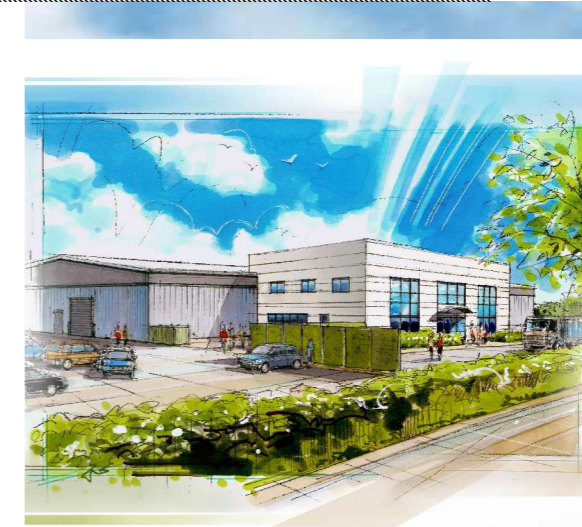
PROPOSED NORTH WEST / FRONT ELEVATION