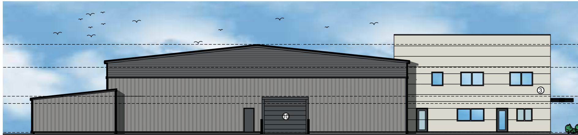
PROPOSED NORTH EAST / SIDE ELEVATION