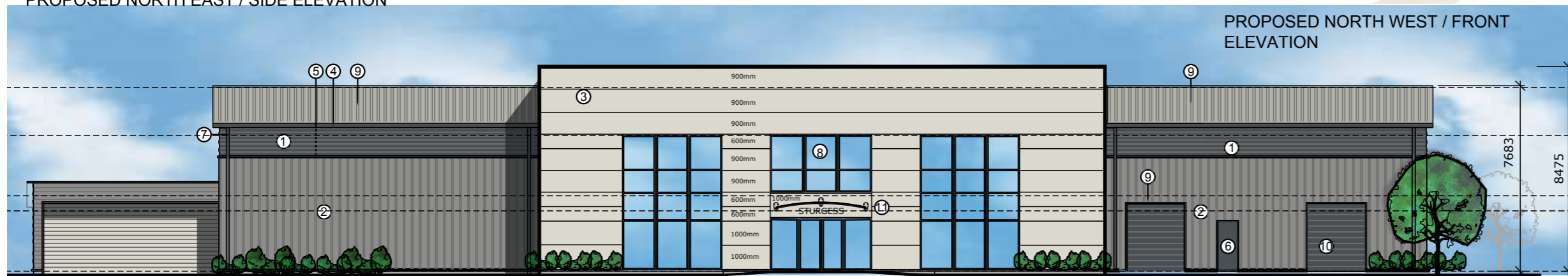
PROPOSED NORTH WEST / FRONT ELEVATION